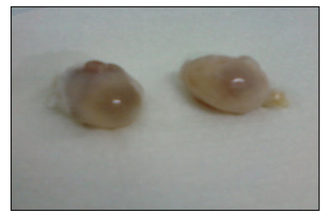
Figure I: Ovaries collected From Cattle